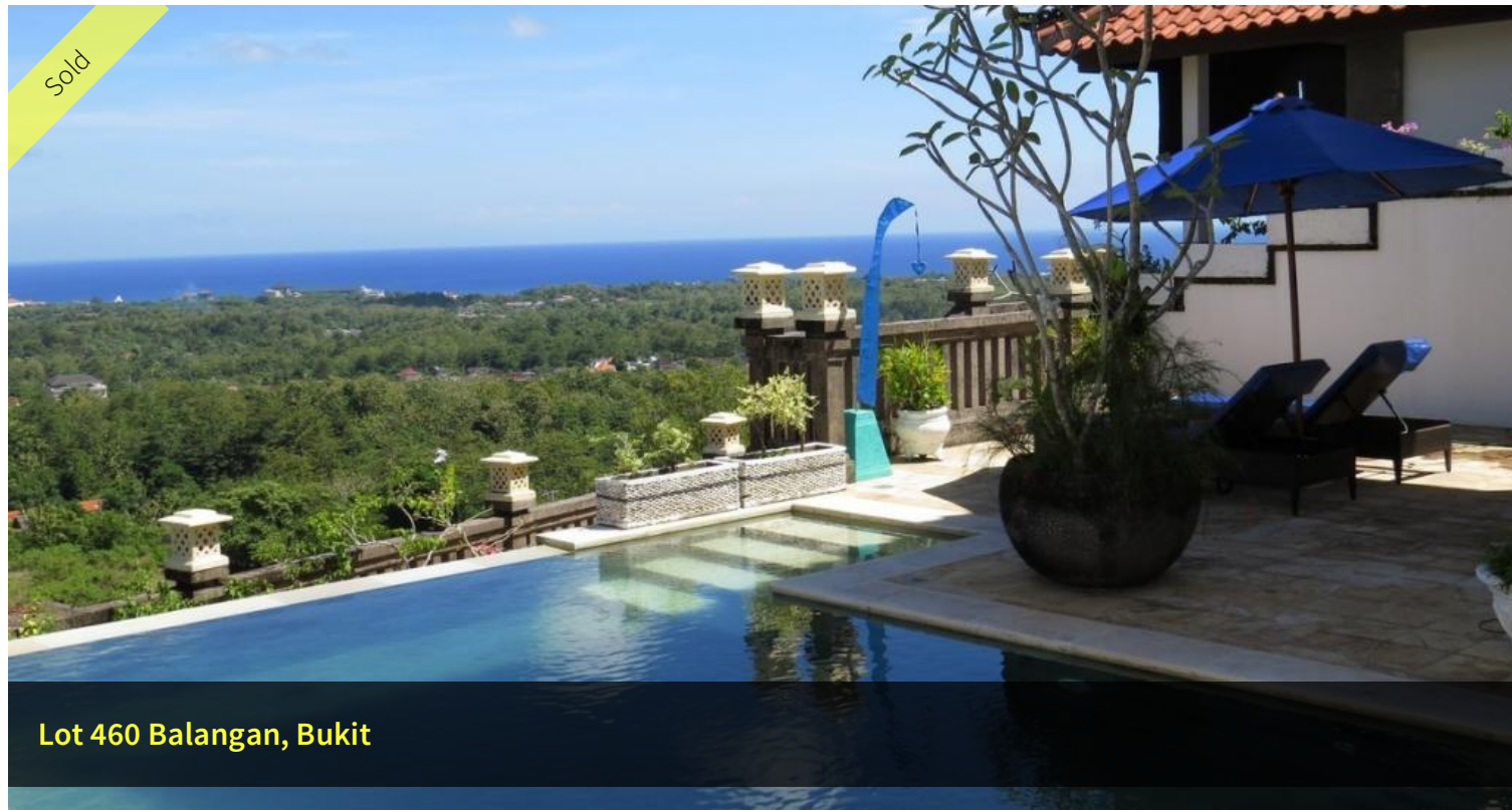
Lot 460 Balangan, Bukit