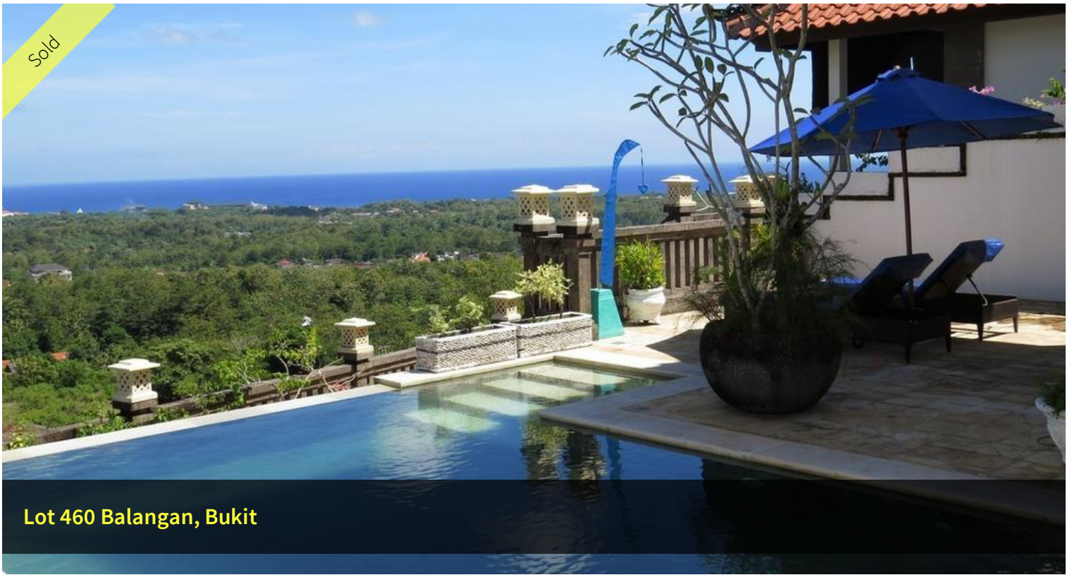
Lot 460 Balangan, Bukit