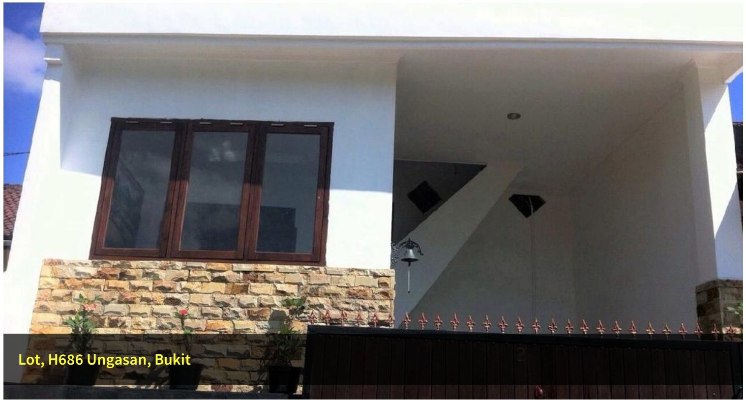
Lot, H686 Ungasan, Bukit